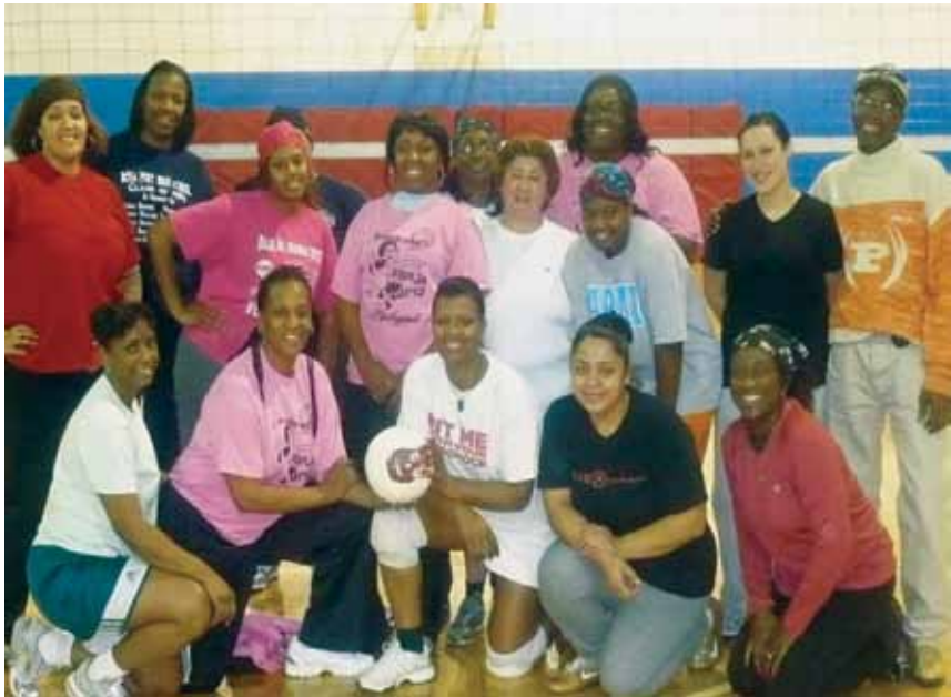
Marcy Newberry Association Women's Volleyball Team first and fourth place winners. Women Professional Sports Association Tournament June 6 – August 17, 2011.