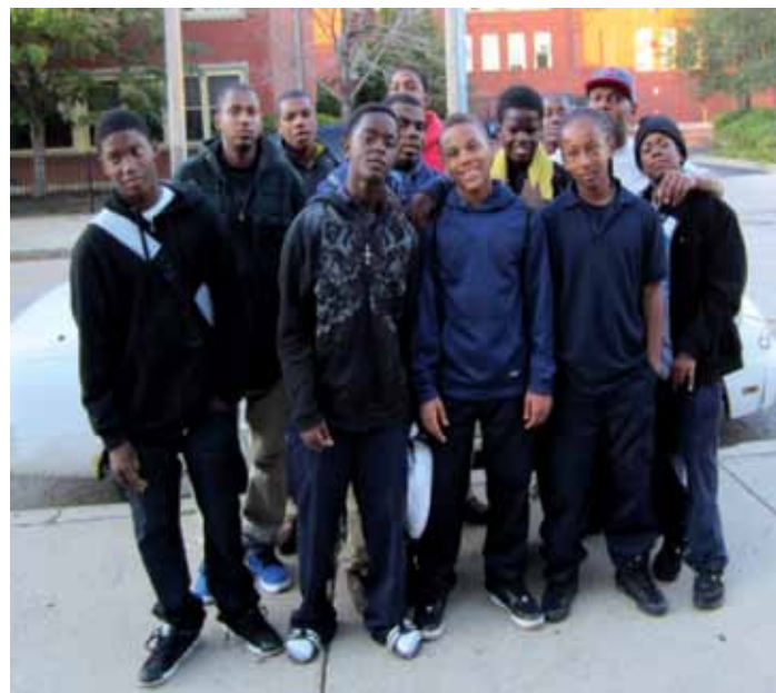
YMATB participants gather early for the evening program.