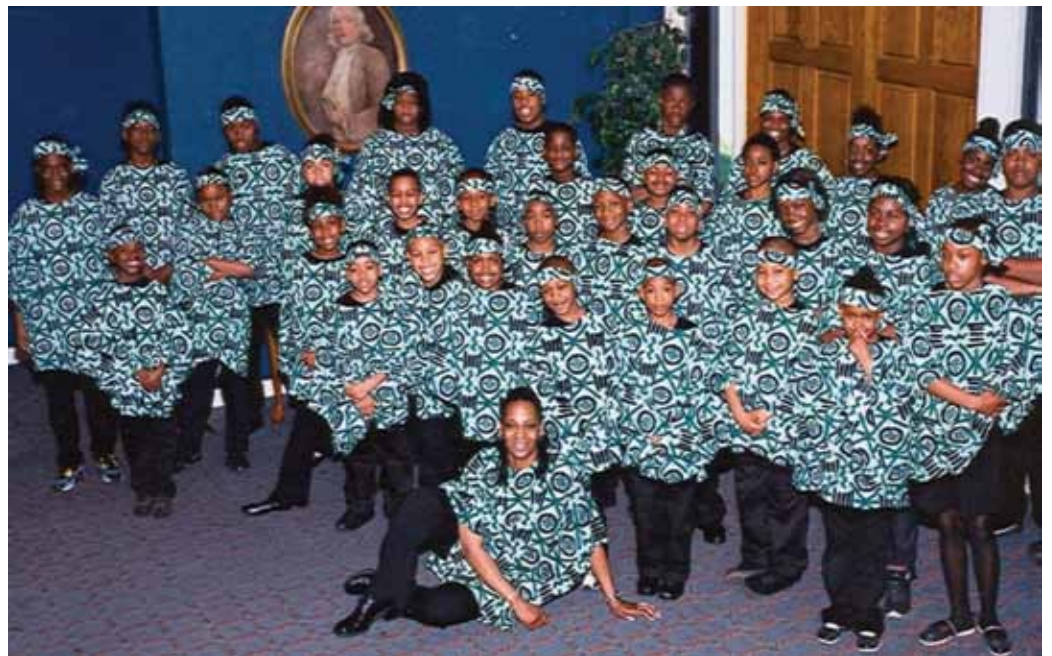
Newberry Community Children's Choir performing at the Lexington House in Chicago